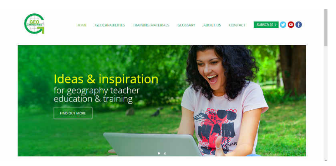
Figure I: The GeoCapabilities website