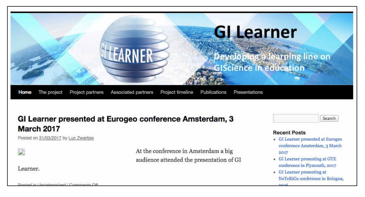
Figure I: GI-Learner Web site (<u>http://www.gilearner.ugent.be/</u>)

EUROGEO will hold its next annual meeting 15-17 March 2018 in Cologne, Germany, this will be an excellent opportunity to meet with other teachers and educators participate in education workshops and share your activities and ideas with others. Find out more at <u>www.eurogeography.eu</u> and follow EUROGEO on LinkedIn, Facebook and Twitter. I can also be contacted at <u>eurogeomail@yahoo.co.uk</u>