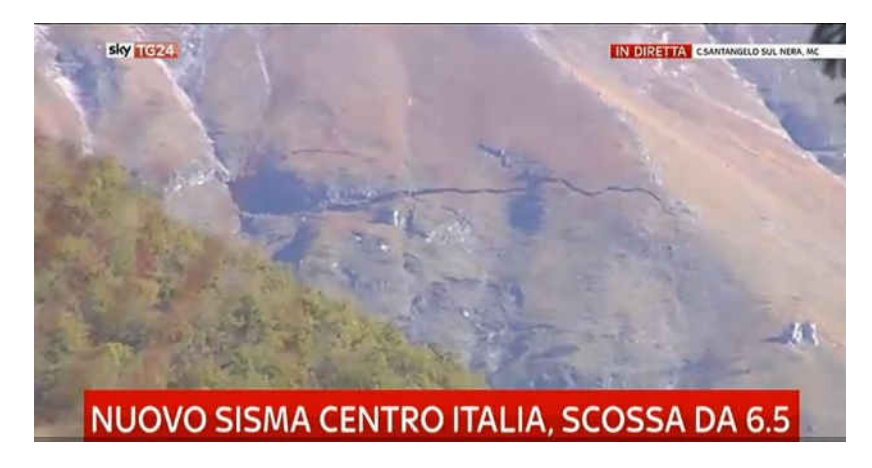
A crack in a mountain nearby to Norcia.