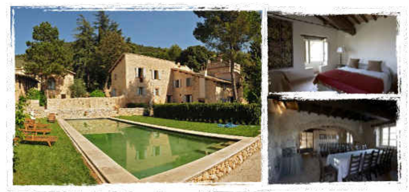
Villa Campo Verde is able to offer school groups special rates out of season and can offer numerous services to enable students and teachers make the best of their stays.

PRICE based on 20 students for a 4 night stay is £470 p.p. and includes: * Bed & Breakfast * All transportation (inc. transfers to/from Perugia Airport) * Local guide for 3 days * Lunches (3 days) * Two staff members go free